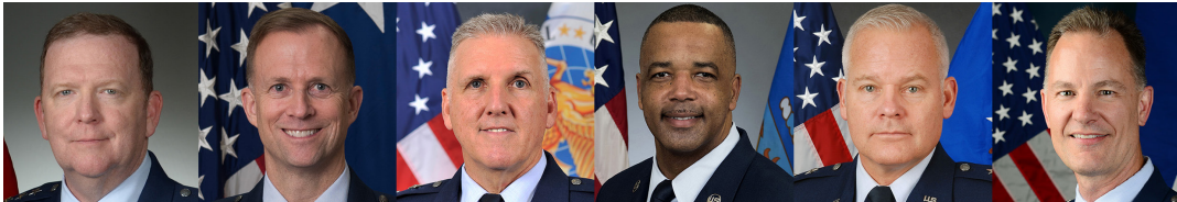
Chief AFR and AFRC/CC

A summary of facts and figures about America's Air Force Reserve