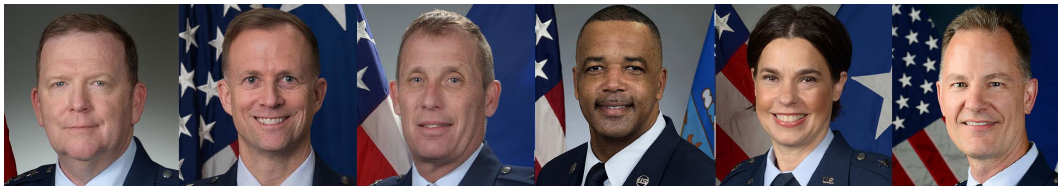
Chief AFR and AFRC/CC

A summary of facts and figures about America's Air Force Reserve