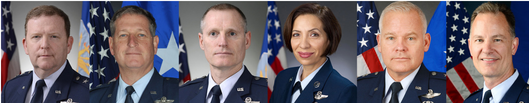
Chief AFR and AFRC/CC Deputy to CAFR AFRC/CD AFRC/CCC MA to AFRC/CC MA to Chief of AFR

A summary of facts and figures about America's Air Force Reserve