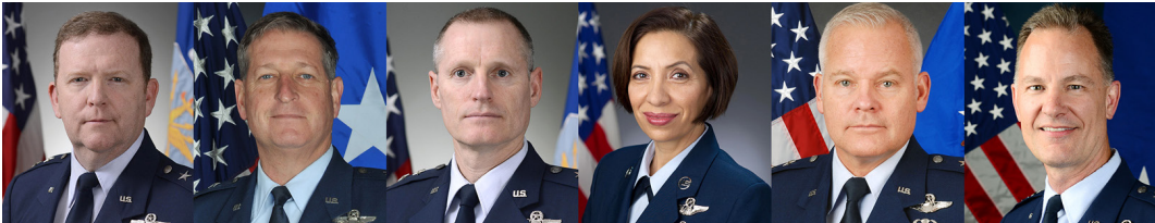
Chief AFR and AFRC/CC Deputy to CAFR AFRC/CD AFRC/CCC MA to AFRC/CC MA to Chief of AFR

A summary of facts and figures about America's Air Force Reserve