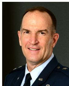
Deputy to CAFR