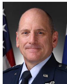
MA to Chief of AFR