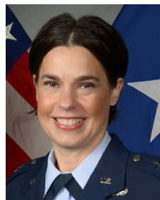
MA to AFRC/CC