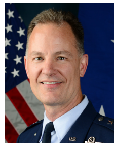
MA to Chief of AFR