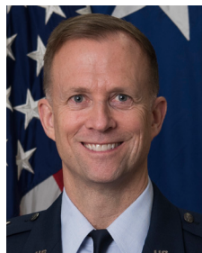
Deputy to CAFR