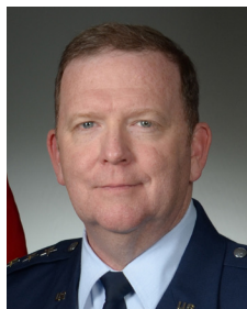
Chief AFR and AFRC/CC

A summary of facts and figures about America's Air Force Reserve